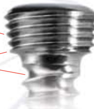
Head and shaft travel at same rate into plate and bone

Zimmer Periarticular Locking Plate System components: