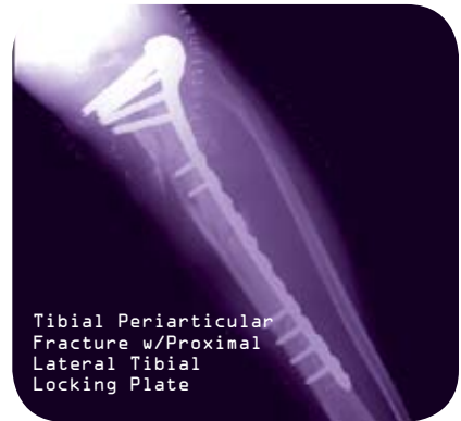
Tibial Periarticular Fracture w/Proximal Lateral Tibial Locking Plate