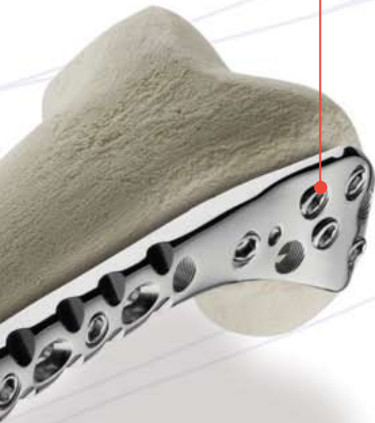
Periarticular Self-Tapping Cortical Bone Screw

The locking plate design does not require compression between the plate and bone to accommodate loading. Therefore, screw purchase in the bone can be achieved with a thread profile that is shallower than that of traditional screws. In turn, the shallow thread profile allows for screws with a large core diameter to accommodate loading with improved bending and shear strength.