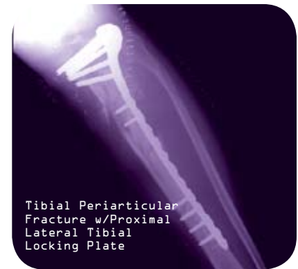
Tibial Periarticular Fracture w/Proximal Lateral Tibial Locking Plate