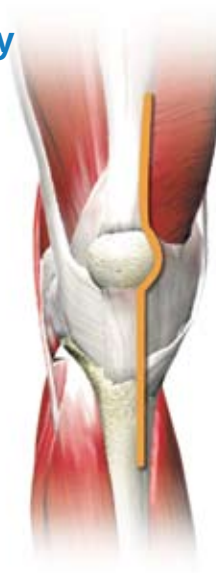
Standard Incision 20-30cm (Quad-Split)